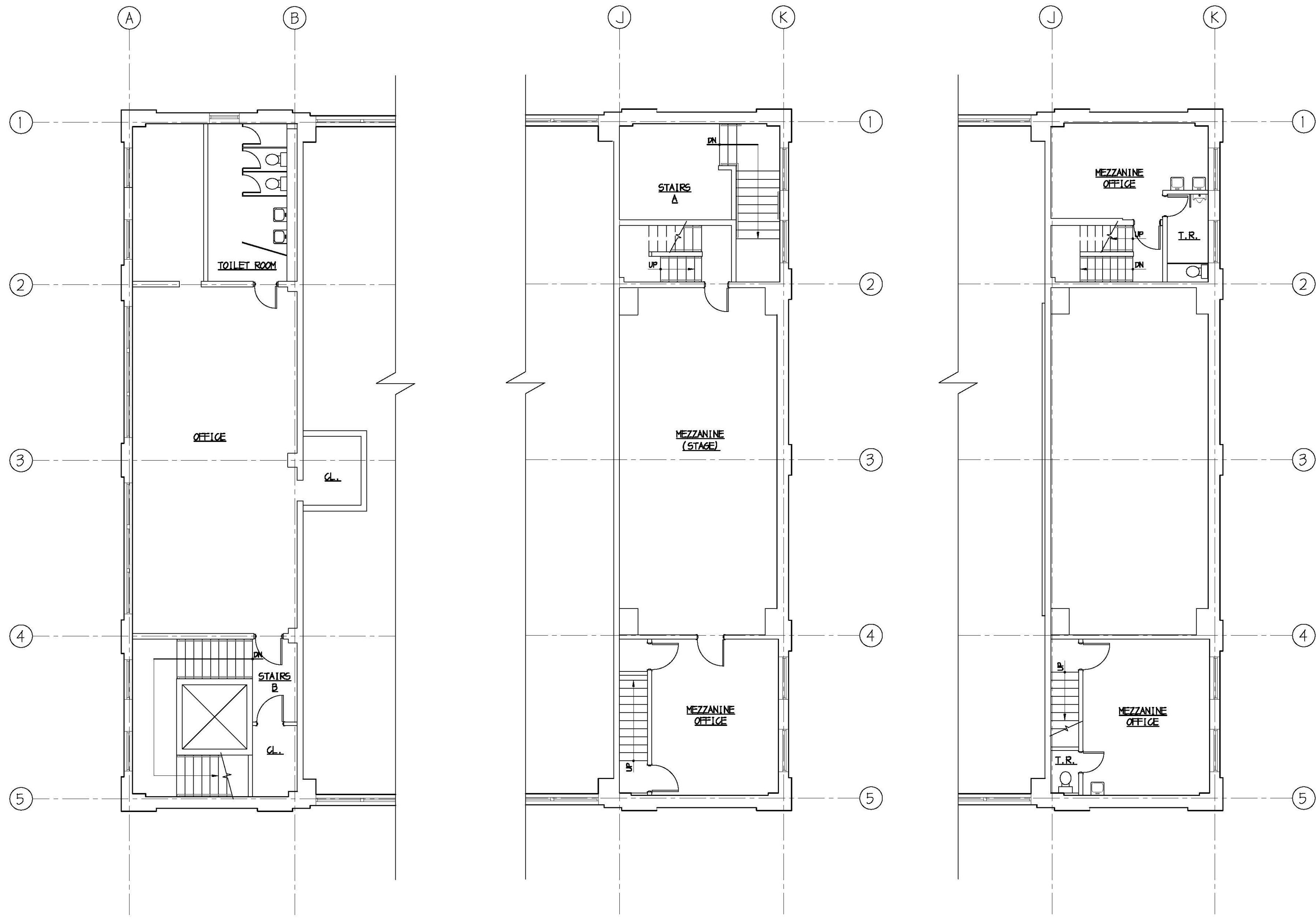
A EXISTING CONDITION - MEZZANINES EX-103 SCALE: 1/8" = 1'-0" NORTH